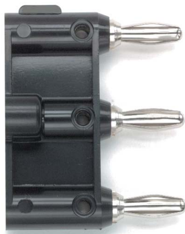
Model 2970 Triple Banana Plug